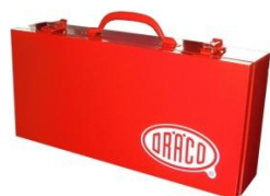
Optional metal box (Item.no. 18000)