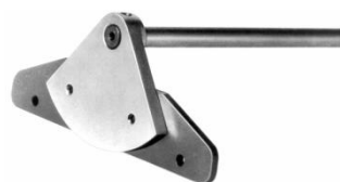
Optional adjustable guide S/01 for precisely straight cut strips (100, 250, 500 mm)